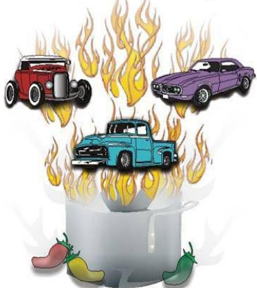
Classic Cars and Trucks Through 1979

EARLY ENTRY FEE $30 (By August 1) ENTRY FEE $40 (August 2 - Sept. 10) LATE ENTRY FEE $50 (Sept. 18 - 22)