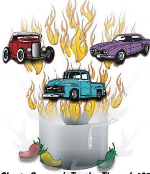
Classic Cars and Trucks Through 1979